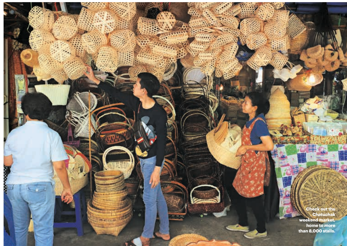
Check out the Chatuchak weekend market, home to more than 8,000 stalls.

4 Start with the sunrise at Pak Khlong Talad, the city's premier flower market, where locals purchase phueng malai , or garlands for good luck. During the day, 27-acre Chatuchak market sells everything from spa products to knockoff Ray-Bans. After 5 p.m. venture just outside the city to Talad Rot Fai, a sprawling, outdoor night market that focuses on the nostalgic, such as antique lamps, vintage clothing, and '57 Chevys. You can also get a 10 p.m. shave in the garage barbershop or sip a beer in a converted VW-bus bar.