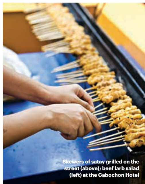
Skewers of satay grilled on the street (above); beef larb salad (left) at the Cabochon Hotel