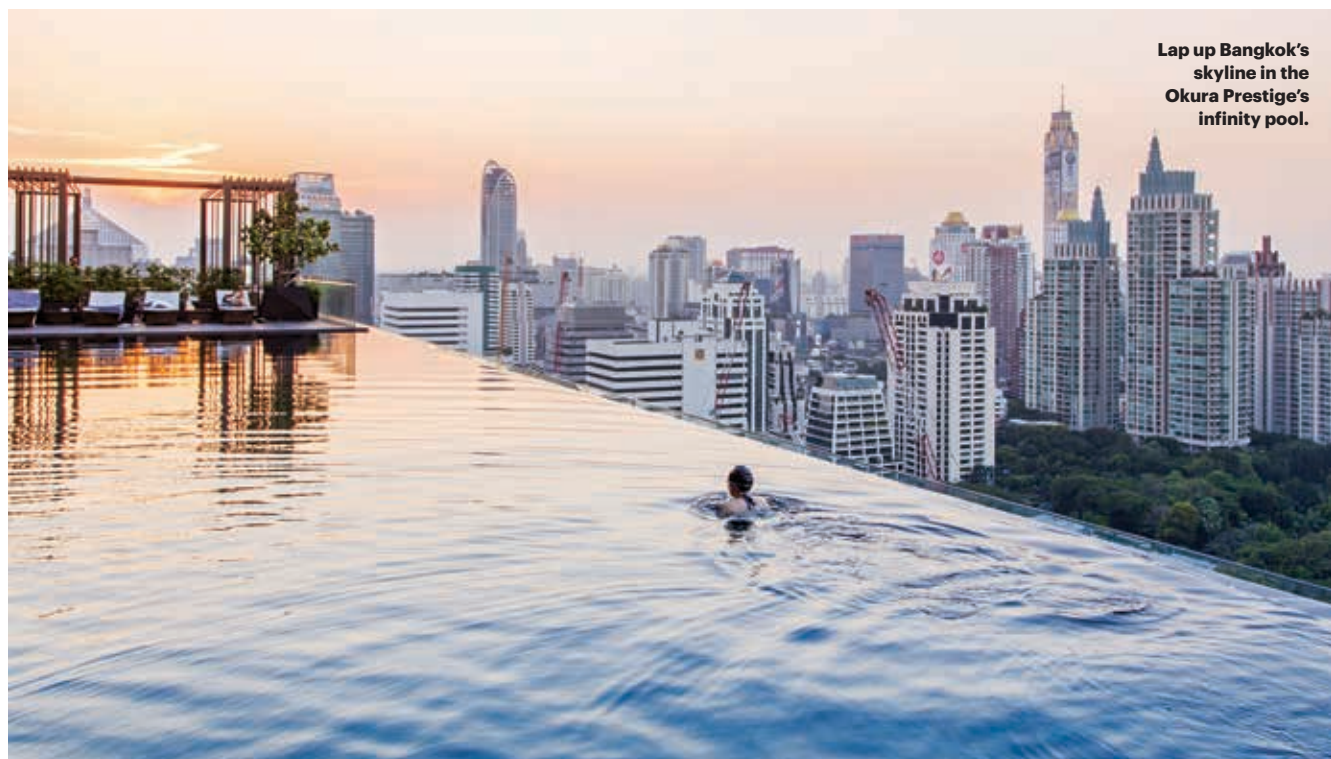
Lap up Bangkok's skyline in the Okura Prestige's infinity pool.

The majority of the rooms in SIAMOTIF (●), a 70-year-old wooden canal house turned bohemian boutique hotel, were hand-painted by a local artist. Amenities here include balconies overlooking the canal, bikes for exploring neighboring temples, and rotating Thai breakfast offerings. At the colonial-chic RIVA ARUN (●), opened in 2016, the view steals the show, whether you're dining on larb ped salad with foie gras on the rooftop or parting the gauzy curtains of your suite's floor-to-ceiling windows. The